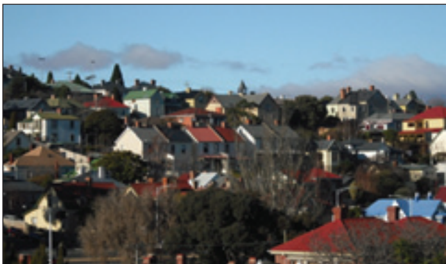
The Glebe Hobart Tasmania – Nibberloonne country