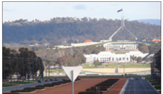
ANZAC parade roundabout Australian Capital Territory – Ngunnawal Country