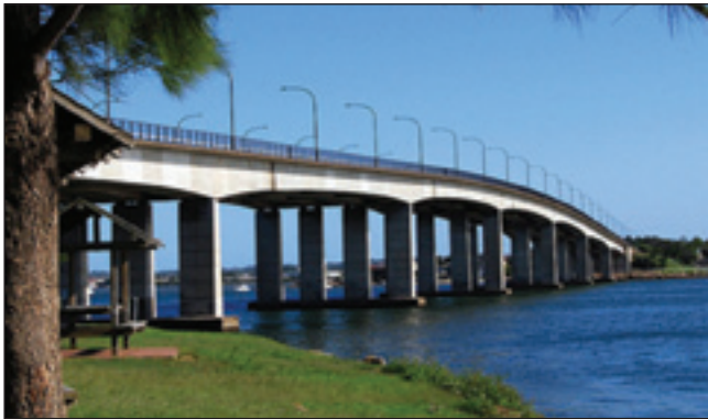
Taren Point, New South Wales – Eora and Dharawal country