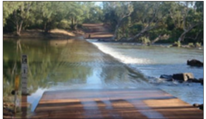
Crossing the Roper River at Roper Bar, Northern Territory – Yugul Mangi country